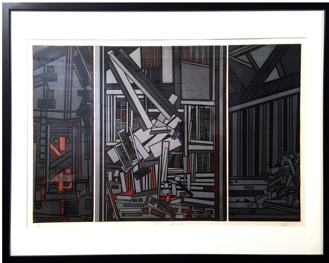
Within Manhattan, Etching (nd) . Copyright 2019 J.Vignone.

The etching, “Within Manhattan” (no date), has a sense of structure like a building’s inner workings of elevators and air vents, or like city blocks, with their crosswalks, back alleys and backyards — crisscrossing angles of grays and blacks with a range of reds that keep the eye moving over the minimalist landscape. Are they city streets, jostling New Yorkers, or simply the shapes that they are?